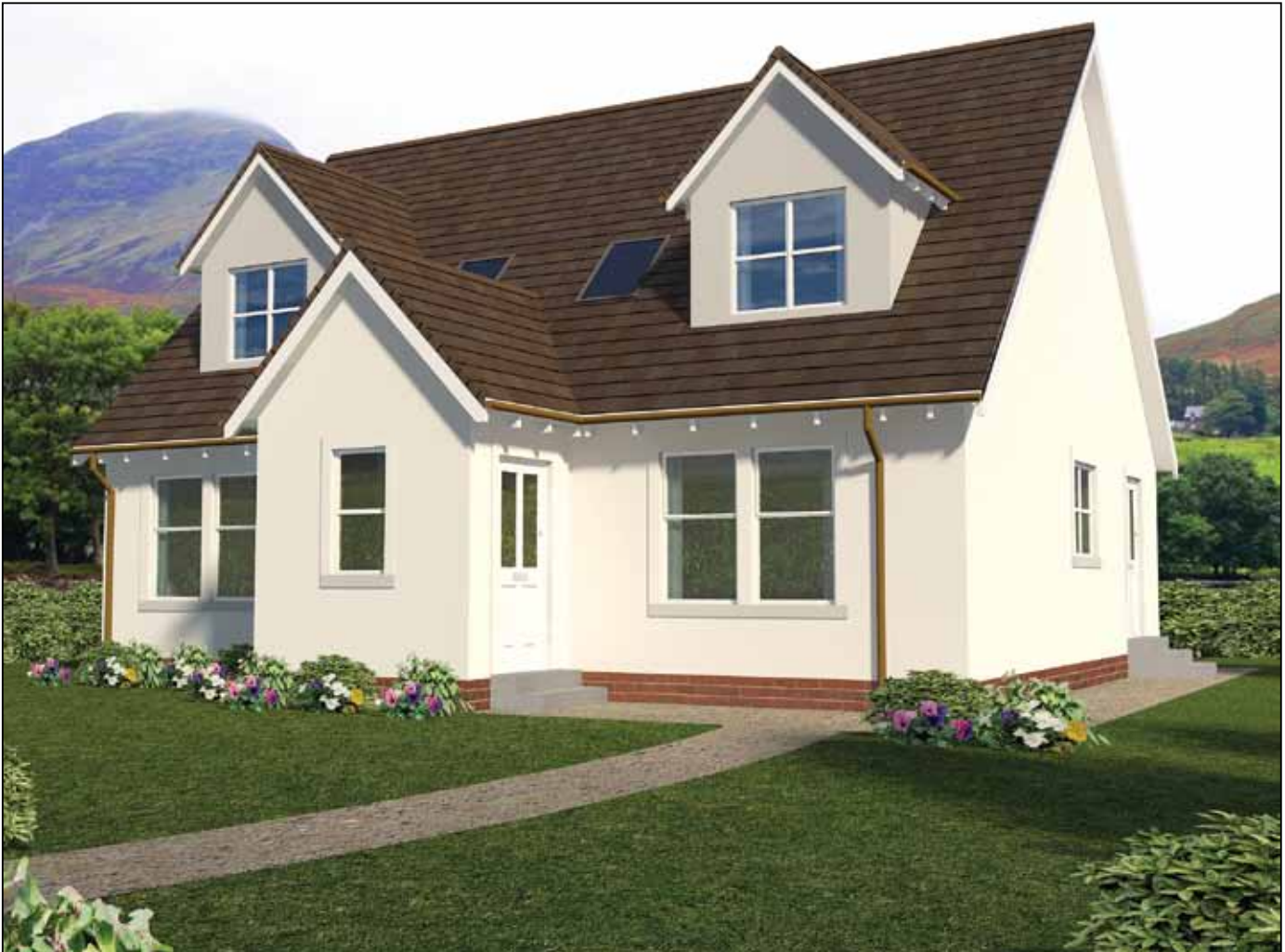
For illustrative purposes only. Not to scale. Plan indicates property layout only.