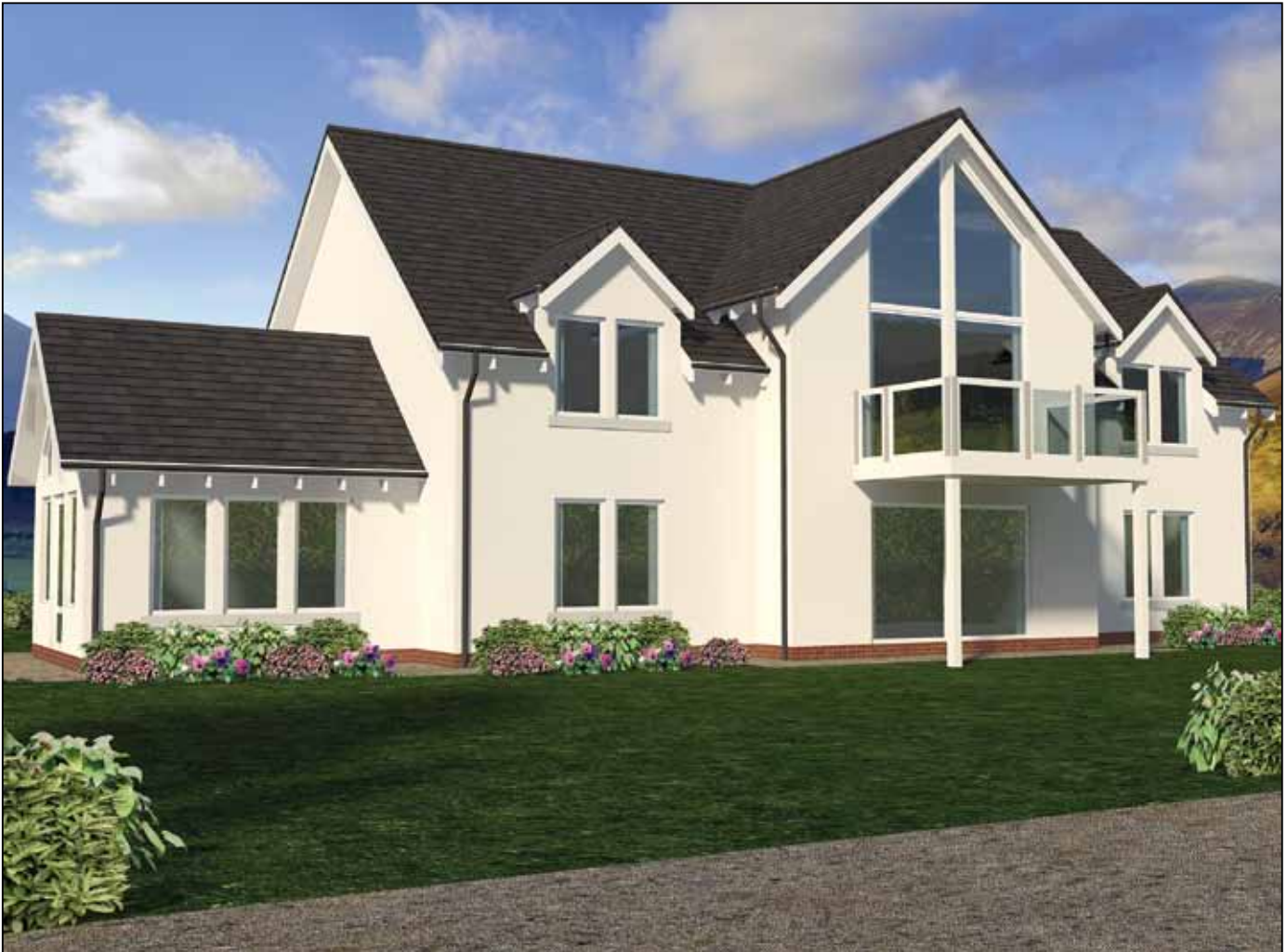
For illustrative purposes only. Not to scale. Plan indicates property layout only.