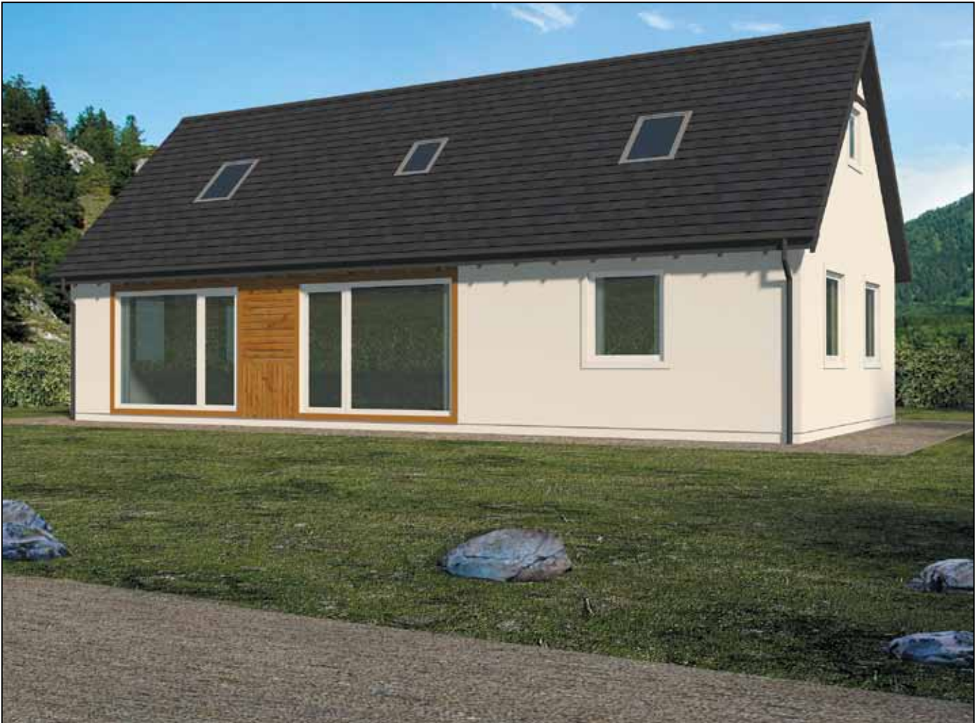
For illustrative purposes only. Not to scale. Plan indicates property layout only.