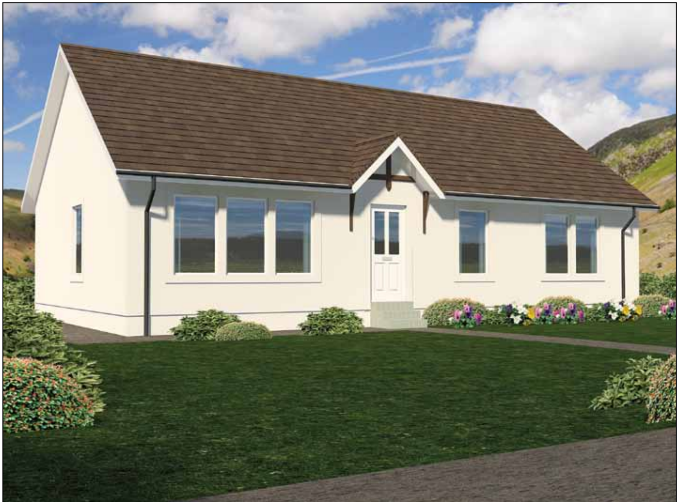
For illustrative purposes only. Not to scale. Plan indicates property layout only.