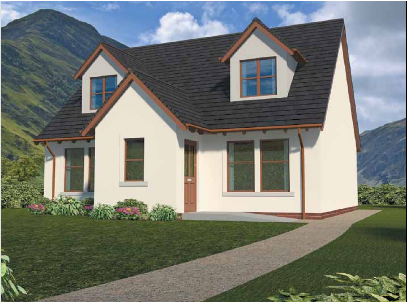
For illustrative purposes only. Not to scale. Plan indicates property layout only.