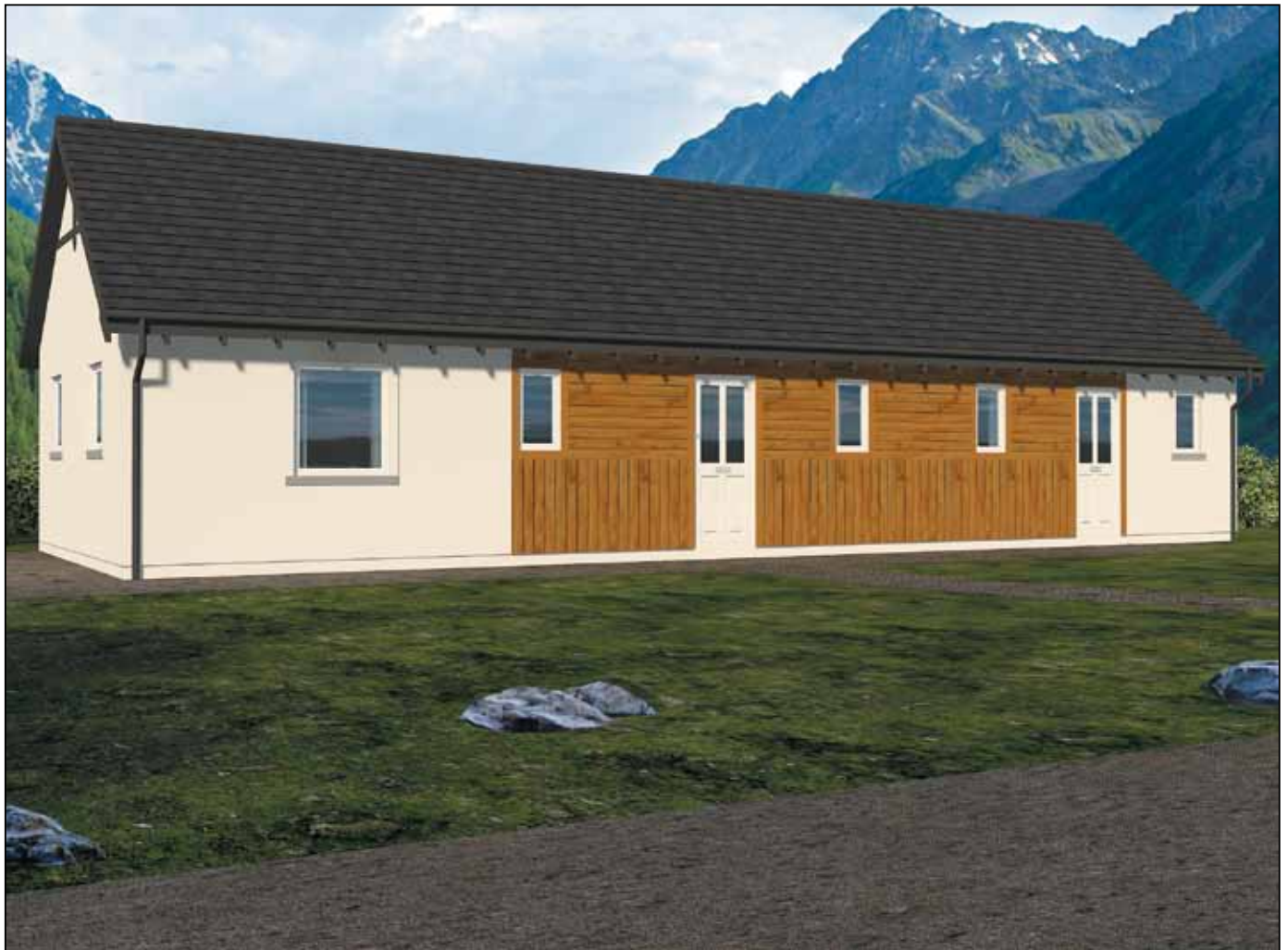
For illustrative purposes only. Not to scale. Plan indicates property layout only.