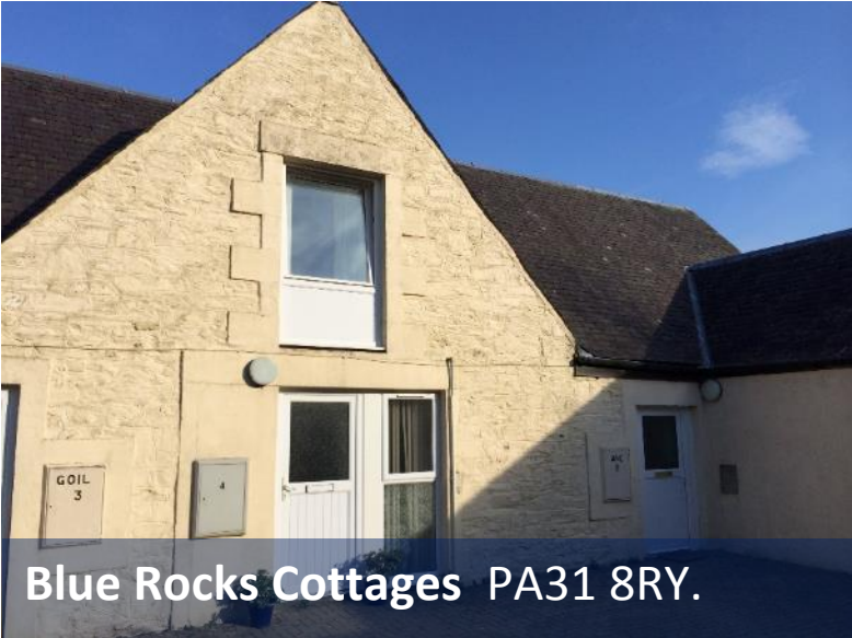
Blue Rocks Cottages PA31 8RY.