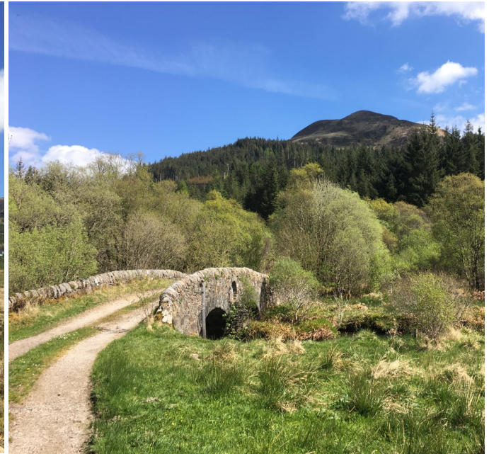
Views from the plot and surrounding area