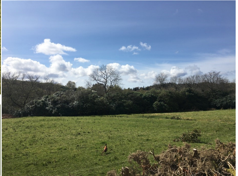
Silvercraigs by Lochgilphead PA31 8RX