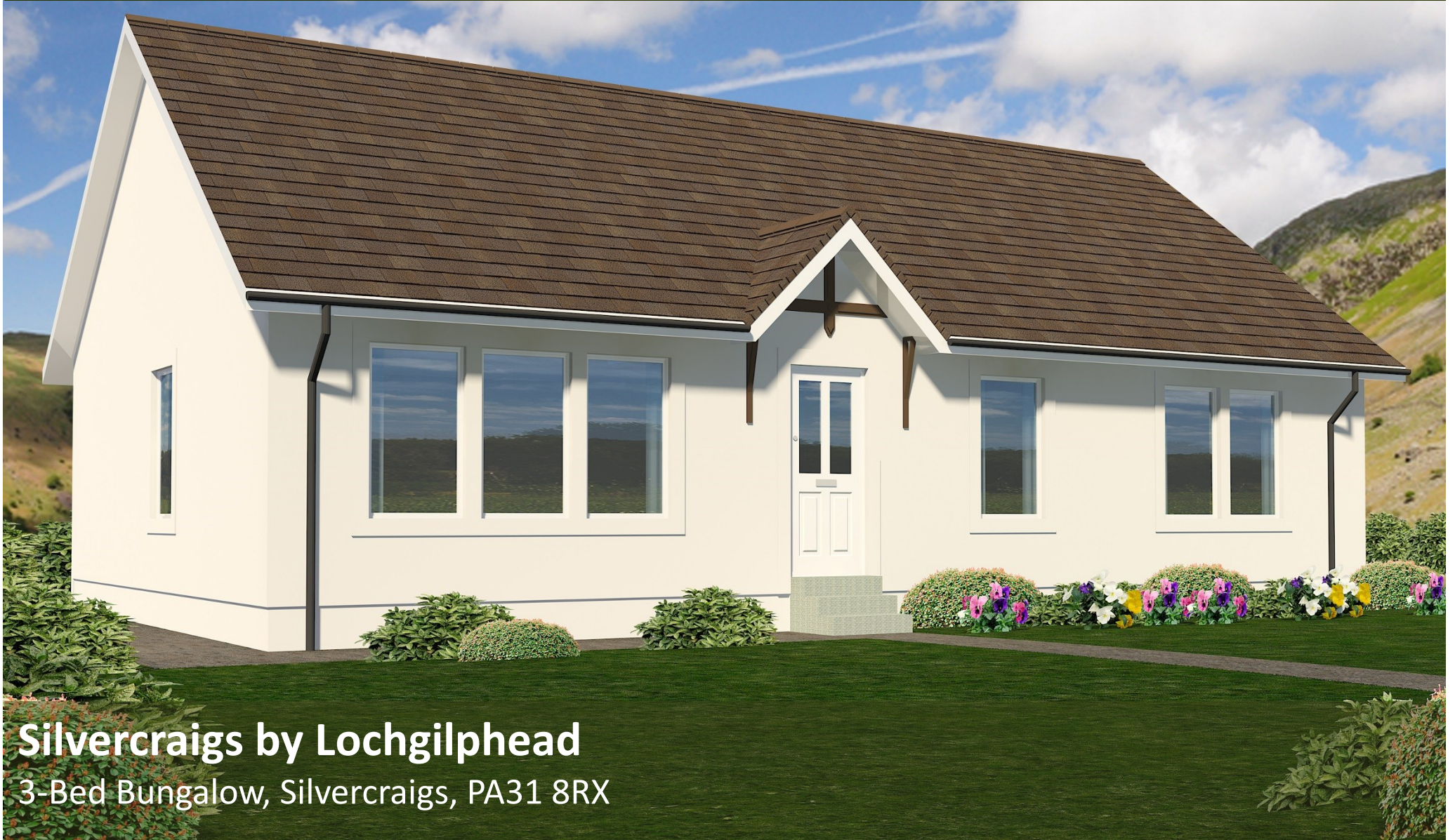
Silvercraigs by Lochgilphead 3-Bed Bungalow, Silvercraigs, PA31 8RX