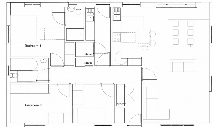
Example floor plan, final design may differ.